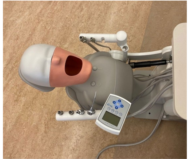
Manikin and handpiece set-up Koury Sim Lab