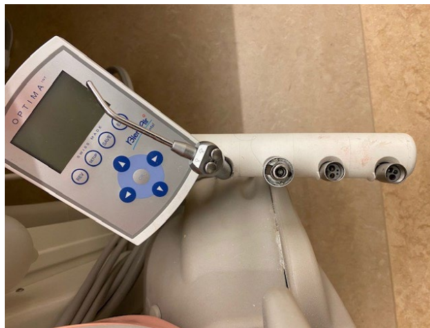
Bien Air Electric Handpiece controls and Air Driven connections