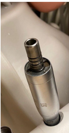
Bien Air Electric Connection