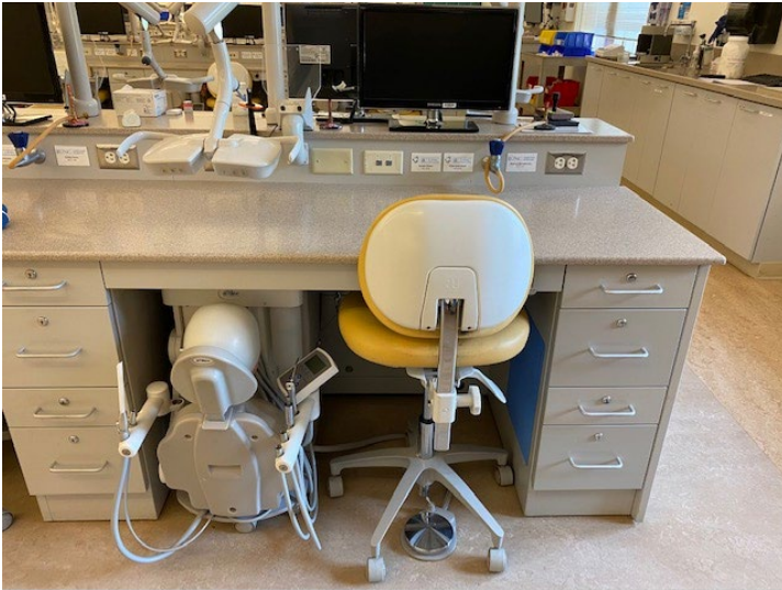
The typical workstation in the Koury Sim Lab