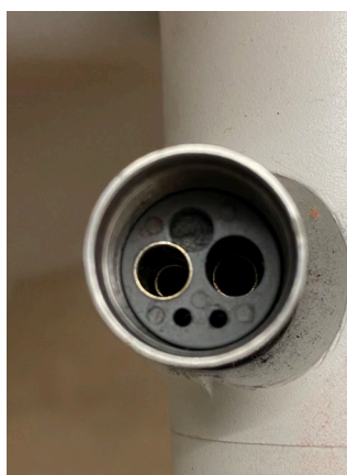
NSK Slow Speed Air Driven Connection